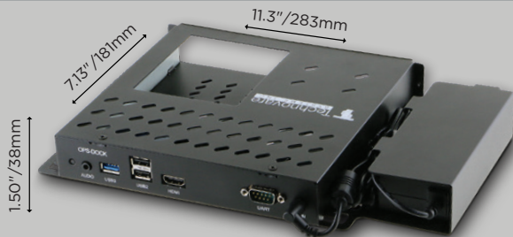
*OPS-DOCK is an accessory and is not included with any version of the OPS-PCAFQ-PH.